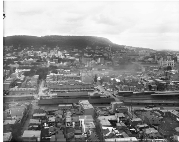
Montréal during the 19 th century. The rapid and significant increase in the density of the urban population raises concern among public health authorities, who push for the construction of a network of aqueducts and sewers.

Coburn (2004) has demonstrated a similar pattern of development in the United States. In Canada, the work of public health historians shows that medical authorities have been concerned by various dimensions of urban building since the middle of the 19 th century. In Toronto and Montréal, notably, health authorities were a significant force behind the creation of the network of sewers and aqueducts (Gagnon, 2006b; McDougall, 1988, pp. 69 and subsequent). In addition, Montréal’s health authorities were later involved in choosing the technologies used to construct that city’s sewers, as well as in the process of situating the pipelines and disposal areas (Gagnon, 2006b, pp. 151–211). Still in Montréal, public health knowledge was also instrumental in planning the expressway network, the aim of which, in the 1940s and 1950s, was to create healthier living conditions for the population by destroying the “hovels” in working class neighbourhoods and by creating access to the surrounding areas, which were thought to offer a better living environment (Gagnon, 2006a).