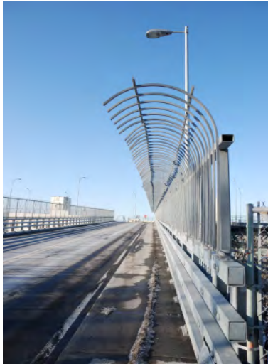
The security barrier on the Jacques-Cartier Bridge, in Montréal, was installed to prevent suicides.

To take another example, public health authorities pushed for the installation of a raised security barrier on the Jacques-Cartier Bridge in Montréal, so as to prevent suicides by persons circulating on the structure.